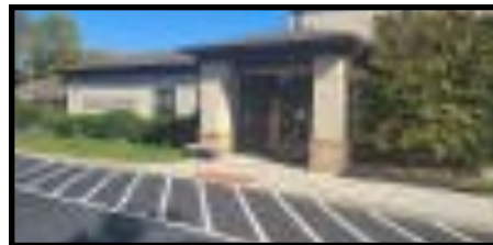
MUA Office at 401 Main Street