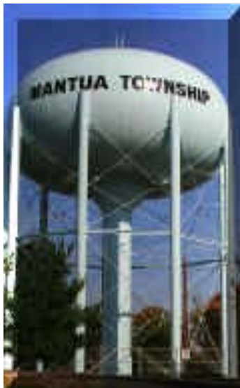
1 Million Gallon Storage Tank Main Street / Barnsboro