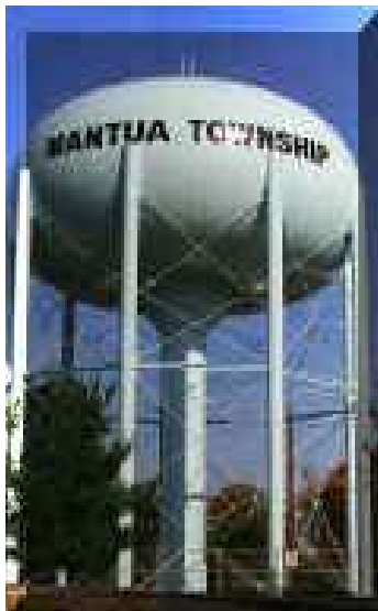
1 Million Gallon Storage Tank Main Street / Barnsboro

In order to ensure that tap water is safe to drink, the EPA prescribes regulations, which limit the allowable amount of certain contaminants in water provided by public water systems. The Food and Drug Administration regulations establish limits for contaminants in bottled water, which must provide the same protection for public health.